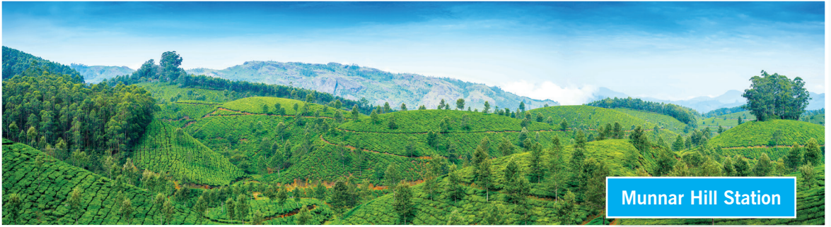
Munnar Hill Station