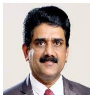
Dr Mohamed Ismail Moulana Hospital, Perinthalmanna