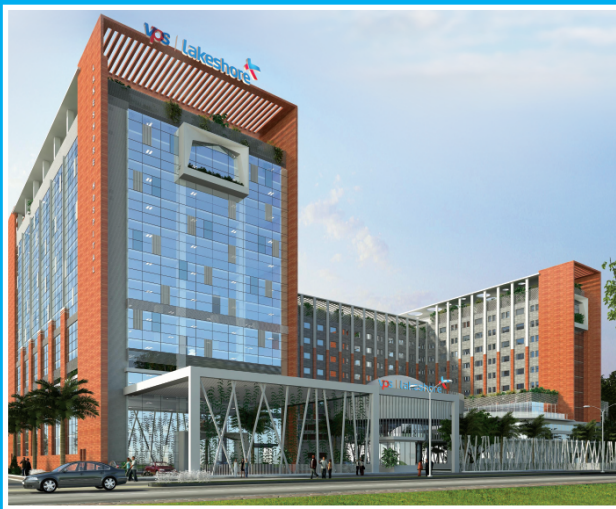
Live Cases at Kochi From VPS Lakeshore Hospital