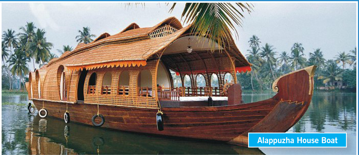
Alappuzha House Boat