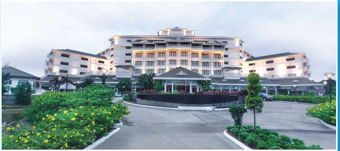
Venue: Le Meridian Kochi