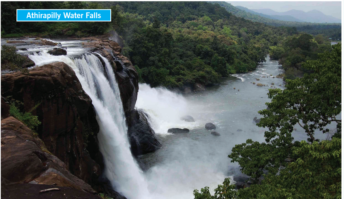
Athirapilly Water Falls